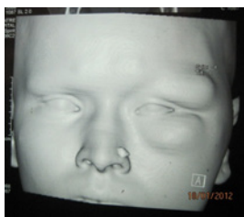
Figure 3: 3D CT scan showing swelling over the left periorbital and zygomatico-temporal region.