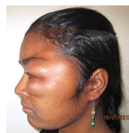
Figure 2: Left lateral view showing diffuse swelling over the zygomatico-temporal region.