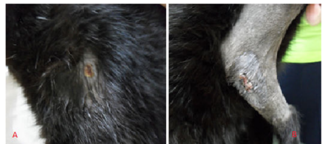
Figure 1: Cat, right thoracic member A: Entrance hole, caused by firearm projectile; B: Lesion after successful surgery to remove projectiles.

Cat, three years, male, castrated, after being rescued by its owner from the streets, for it had escaped 2 days ago, was analyzed and verified the presence of incised-stab wounds on right thoracic member and claudication (Figure 1A). At the clinic exam, the animal showed normal parameters. During the orthopedic exam stated the presence of crackling, at the radiographic exam it was possible to check radiopaque substance, between the tissues and in the bones (radius and ulna) too (Figure 2). The surgical intervention was successful, where it was done and the animal post-op follow up for the next 10 days until discharged, who recovered successfully (Figure 1B).