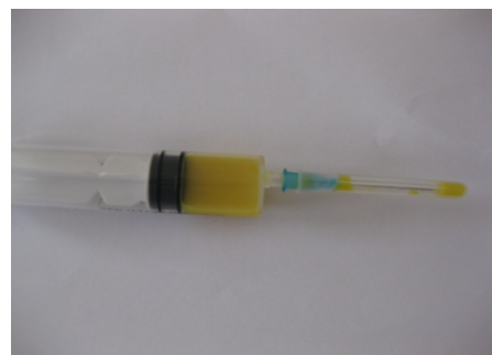
Figure 2: Milky pleural fluid.

effusion. Thoracocentesis yielded milky fluid suggestive of chylothorax. (Figure 2).