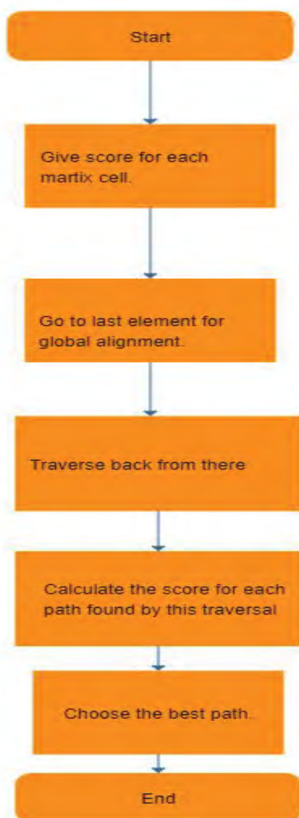
Figure 1: Yed representation of the algorithm.

It is based on an execution methodology which is based on parallel