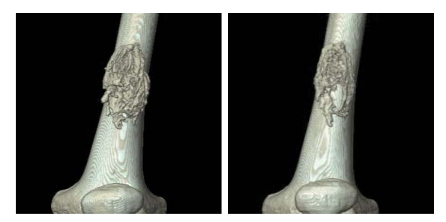
Figure 3b. CT images at 4 and 8 weeks.