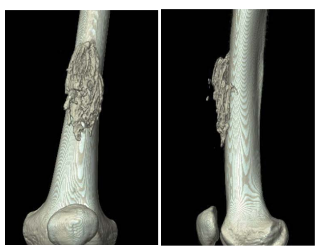
Figure 2. Three-dimensional CT scans provided detailed images of flocculent calcifications, as an immature calcified mass.