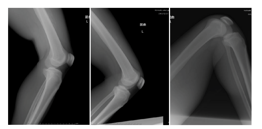
Figure 4. The range of motion of knee flexion improved to 75 degrees at 5 weeks and 130 degrees at 8 weeks of hospitalization.