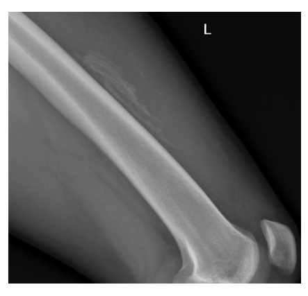
Figure 1A. A radiograph showed a lacy pattern of new bone formation with a central zone of uneven density adjacent to the anterior aspect of the left femur at 4 weeks after the initial trauma.

During stages I and II, ESWT was used as a conservative therapy. Extracorporeal shock waves (ESWs) were generated using an electromagnetic generator (Dornier Epos Ultra, Donier MedTech, USA). The waves were concentrated to a focal area of 2 to 8 mm using a reflector focusing on the target site [18]. The ESWs, in the shape of cylindrical pressure waves, were localized using ultrasound imaging. Each EWST treatment consisted of 3500 pulses at 4 Hz with an energy flux density in the range of 0.03 to 0.36 mJ/mm<sup>2</sup> delivered to the mass from the area of ossification outlined on the skin. The energy flux density was gradually increased within the painless range in order to avoid pain from EWST without anesthesia [19]. EWST treatments were