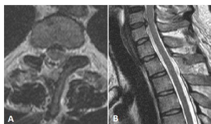
Figure 3: Post-operative T2-weighted MRI in the axial (A) and sagittal (B): The MRI shows that ligamentum flavum with calcification was removed and there is no evidence of cord compression.

Postoperatively, the patient's symptoms such as chest tightness and bilateral arm numbness improved immediately, except for surgical site pain. T2-3 level of spinal stenosis in postoperative MRI imaging was able to confirm that decompression was enough (Figure 3). The patient was discharged 10 days postoperatively, and all his symptoms had improved; as of this report, 5 months after the operation, he had adapted well to social activities.