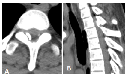
Figure 2: Computed tomography in the axial (A) and sagittal (B): The CT of thoracic spine revealed ligamentum flavum ossification with compression of the central canal.