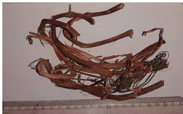
Figure 5. Strangling material (wild creeper plant) cut during autopsy.

Internal: No abnormality was detected in the scalp, skull, vertebrae, meninges, ribs, cartilages, vessels, peritoneum, pharynx and oesophagus. Brain, spinal cord, pleurae, larynx, trachea, both the lungs, pericardium, liver, small and large intestines, spleen, both kidneys were found congested. Three deep laceration marks were found on the lower abdominal wall, few cm above the vaginal wall. Semisolid food particle was found in the stomach. Rigor mortis was present.