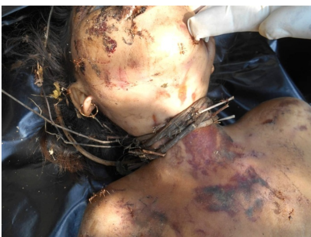
Figure 2. Wild creeper plant tied around neck to strangle the victim.