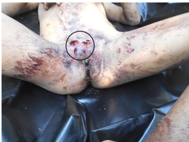
Figure 3. Multiple deep laceration wounds above the vagina with bleeding injury.