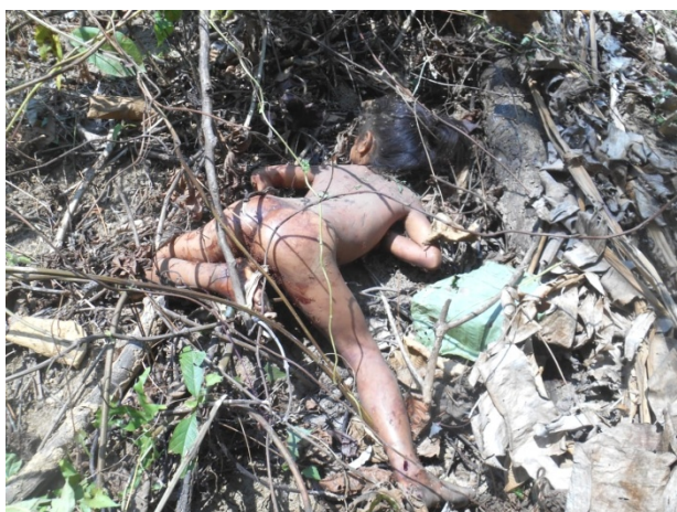
Figure 1. Victim lying on spot (in a bushy area).