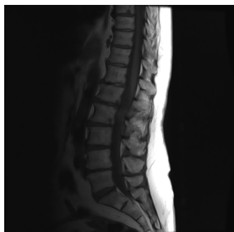
Figure 1: Sagittal T1W MRI shows an isointense lesion affecting the cauda equine roots at L2 level.

Female patient, 67, started paresis of the left leg 2 months ago, slowly progressive, not associated with pain or paresthesias. Physical examination revealed diffuse and asymmetric paresis of the left leg, with the absence of patellar and ankle reflexes. It was held lumbosacral spine magnetic resonance imaging (MRI), which showed focal thickening of the roots of cauda equina at the level of the second lumbar vertebra, appearing isointense on T1W (Figure 1) and isointense on T2W (Figure 2), with marked homogeneous enhancement by gadolinium (Figure 3). It was performed a research for neoplastic cells in a sample of cerebrospinal fluid, being negative. Then, it was performed an open biopsy of the lesion by bilateral laminectomy direct on the site