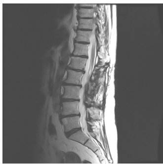
Figure 5: Sagittal T2W MRI shows the reduction of the thickening of the roots of cauda equina after chemotherapy and radiotherapy.

of the lesion, with intraoperative neurophysiological monitoring, being identified a nonfunctioning root for removal and analysis by freezing (Figure 4), which was suggestive of lymphoma, and then the procedure was interrupted. Immunohistochemistry analysis confirmed the diagnosis of Diffuse Large B-Cell Lymphoma. The patient underwent chemotherapy treatment based on 4 cycles of R-CHOP scheme - Rituximab, Cyclophosphamide, Vincristine, Doxorubicin and Prednisolone. A MRI performed 3 months after initiation of treatment shows reduction in the thickness of the affected roots (Figure 5). She remains stable until the date of this report.