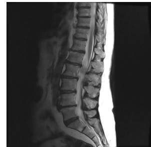
Figure 2: Sagittal T2W MRI shows an isointense lesion affecting the cauda equine roots at L2 level.