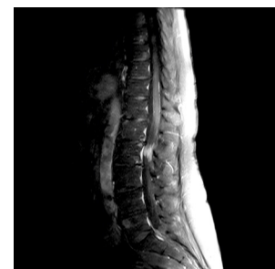
Figure 3: Sagittal T1 post-Gd MRI shows the thickened and highly enhanced roots of cauda equina at L2 level.

*Corresponding author: Pedro Radalle Biasi, Av. Sete de Setembro, 65, ap 101 99010-121, Passo Fundo, RS, Brazil, Tel: +55 54 9617 2514; E-mail: pedrobiasi@doctor.com