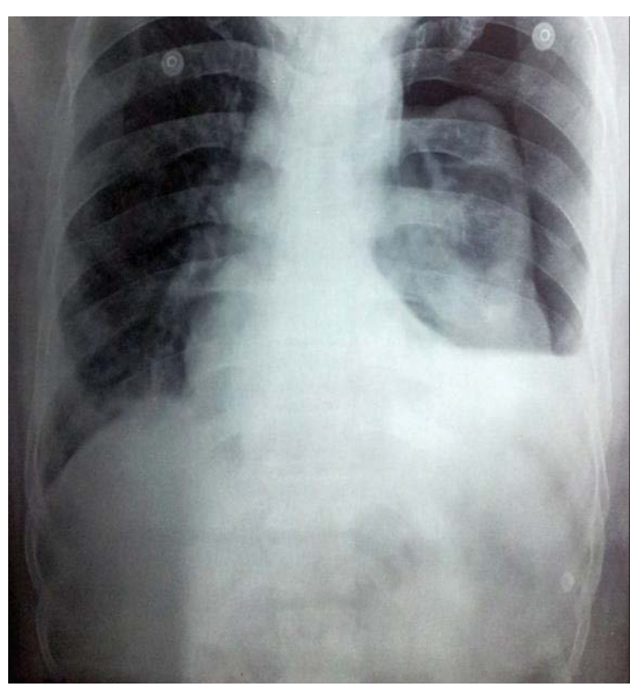
Figure 1: chest x-ray pa view showing left sided hydropneumothoxax.