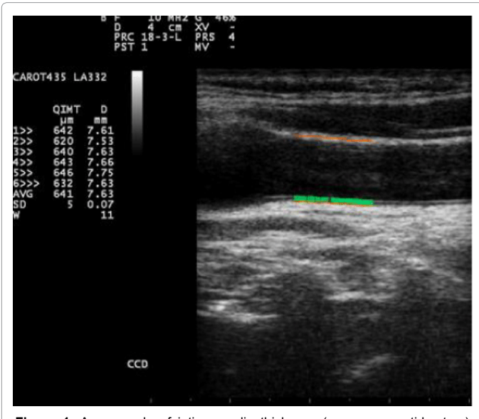
Figure 1: An example of intima-media thickness (common carotid artery) recording obtained by automated ultrasonograph.

Categorical data were presented as numbers and percentages, continuous data were expressed as mean \pm standard deviation (SD) or median and interquartile range, depending on the pattern of distribution of each variable. To compare proportions, the chi-square test or the