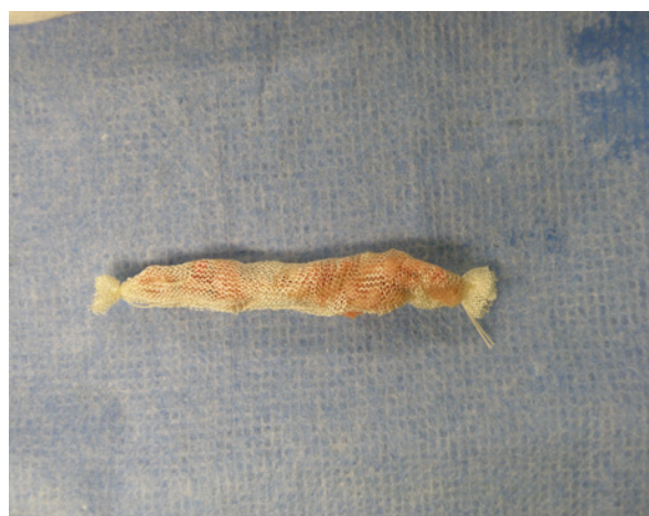
Figure 2: Autologous local bone graft pieces wrapped in Surgicel. Adaptation and molding of local bone graft is very easy.