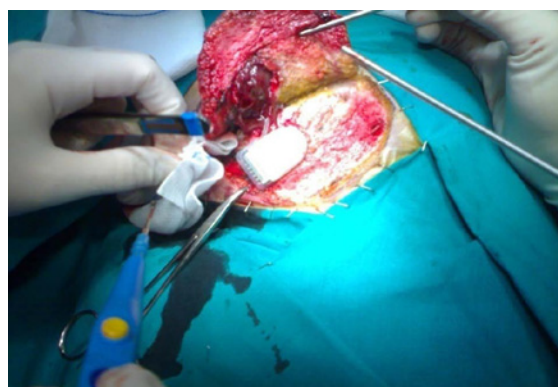
Figure 3: There was osteogenesis at the receptor's bed and atrophy at the flap's internal face.