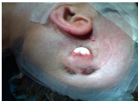
Figure 2: Once the detritus are removed, the internal receptor's extrusion can be observed.