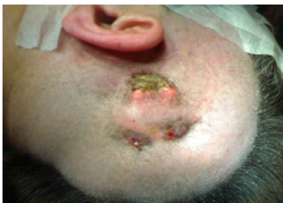
Figure 1: Signs of extrusion of the CI on March 2008.