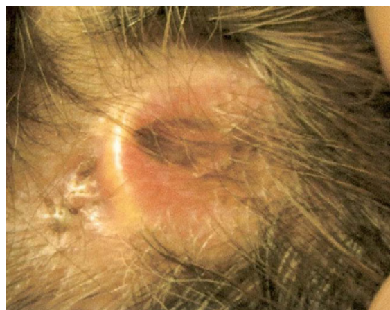
Figure 6: New extrusion of the implant with thinning and granuloma formation at the flap.

of the antenna and its posterior extrusion. This would be a mechanical traction-expulsion process [13].