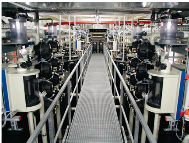
Picture 1: Example of a delay and decay system developed and built by EnviroDTS (Robert Bosch Hospital, Stuttgart).