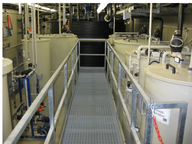
Picture 2: Bioreactors with sedimentation chambers (Katharinen Hospital, Stuttgart).