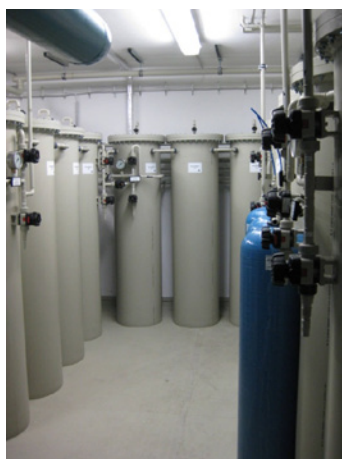
Picture 3: Overview of the adsorption filter modules with activated carbon (Katharinen Hospital, Stuttgart).