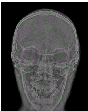
Figure 2: Plain trans-orbital skull film taken intra-operatively following placement of the second cochlear implant device confirming full insertion of both electrodes within the respective cochleae.

The patient's post-operative course was uncomplicated and his implants were activated on post-operative day 20. At activation he was found to have normal thresholds at all frequencies bilaterally. The patient continues to be a daily user of his implants despite a small amount of facial nerve stimulation on the right implant but excellent performance from his left implant.