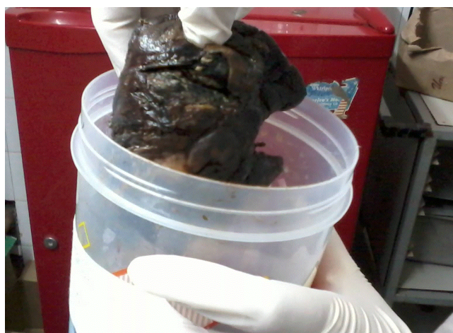
Figure 3: Surgical specimen showing fungal ball.

Sputum for AFB was positive twice. Our complete diagnosis was Active Cavitary Pulmonary Tuberculosis with Aspergilloma. Patient underwent left upper lobectomy with peroperative findings of cavitation in left upper lobe with fungal ball (Figure 3).