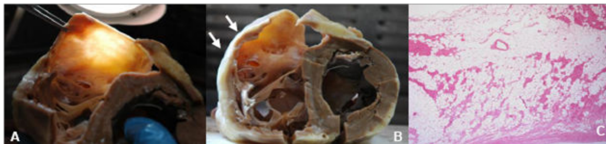
Figure 2: Right ventricle outflow tract wall thinning at transillumination (panel A). Total fibro-fatty replacement of right ventricular myocardium (panel B-C)