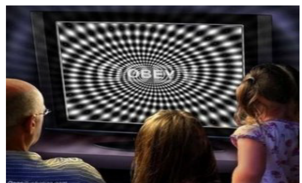
Figure 2: The hypnotizing effect of the Media Industry.

"Political economy is a branch of social science that studies the relationships between individuals and society and between markets and the state, using a diverse set of tools and method drawn largely from economics, political science, and sociology" [9]. Furthermore, political economy "involves the idea of media ownership, the media market, and financial support. Remarks that in the capitalist societies the capitalized and commercialized mass media have little difference from the other commodities in nature, they resemble the other commodities very much, both are used for profit for the capitalists, and are bound to be heavily dependent on the capitalist because their