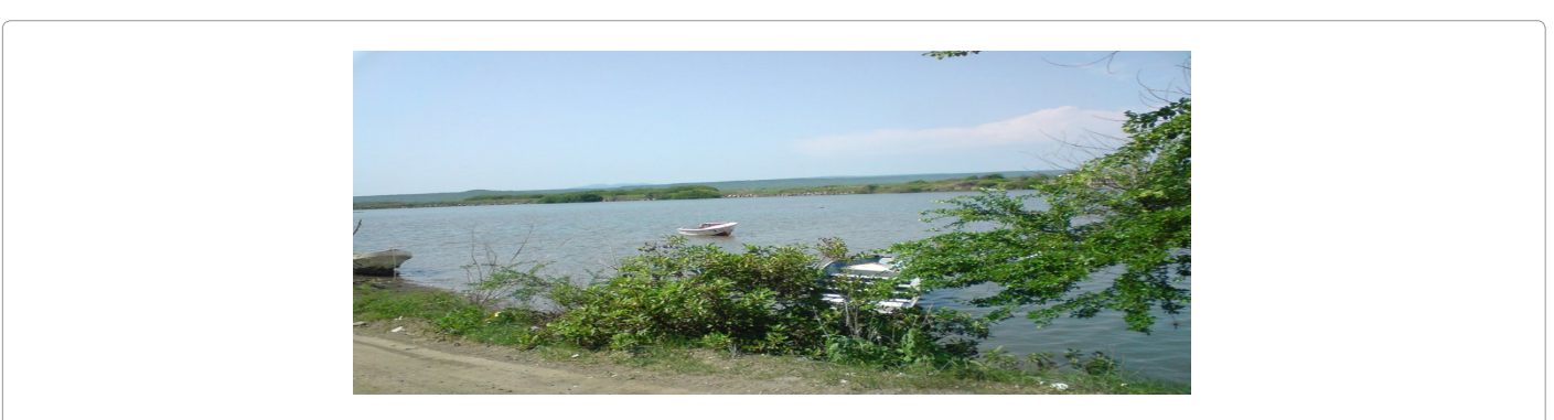
Figure 1: The fishing camp "The Tazajal". Source: Internal information of the Cooperative Society of Fishing Production the Patole, S.C. of R.L. de C.V.

B. Administrator: The person who takes control and makes decisions on minor issues in which it is not necessary to call the board. It is supported by an administrative assistant, who helps him in the record of the documents required for their duties.