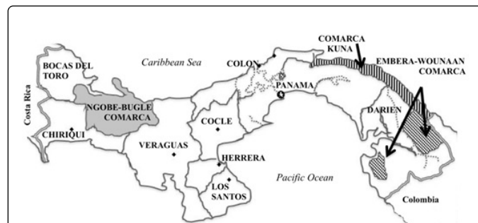
Figure 1: Map of Panama's Provinces showing the locations of samples collections. The number of samples collected per province representing the percentage of contribution to the country's population is Bocas Del Toro n=9 (2.8%) Coclé n=23 (7%), Colon n=25 (7.4%), Chiriqui n=48 (14%), Darien n=5 (1.4%), Herrera n=14 (4%), Los Santos n=12 (3.4%), Panama n=174 (53%), Veraguas n=24 (7%).

Venous blood samples (10 mL) were obtained by phlebotomy and were collected into tubes containing EDTA anticoagulant buffer. Tubes were gently mixed to ensure that the EDTA and blood were adequately mixed. After extraction, blood samples were immediately processed or stored at 4°C, for a maximum of 1-4 days. Approximately 125 µL of blood were placed onto the center of each of four circles of commercially prepared FTA® cards (Whatman® FTA® card technology). An FTA-blood punch was used to cut a small piece of the FTA card-containing blood, and the small piece was processed for DNA extraction according to the procedure specified by the DNA IQ™ Reference Sample Kit for Maxwell® 16 (Promega® Corporation, Madison WI, USA). DNA samples were eluted in 300 µL of elution buffer; their concentration determined and later used for PCR amplification.