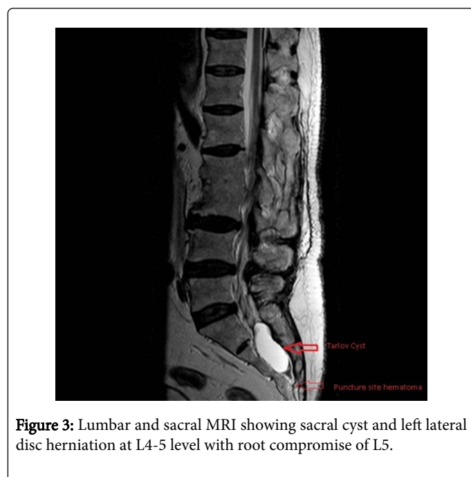
Figure 3: Lumbar and sacral MRI showing sacral cyst and left lateral disc herniation at L4-5 level with root compromise of L5.

An MRI showed a sacral cyst of 50 × 18 mm (Figure 3) that was not visible in the CT scan, and a left lateral disc herniation at L4-L5 level with root compression of L5. Two days later, an interlaminar paramedial epidural at L5-S1 level was performed under fluoroscopy guidance to treat the radicular pain. Radicular leg pain improved after the epidural steroids injection (NPRS 3) and the patient was followed for 6 months without pain worsening.