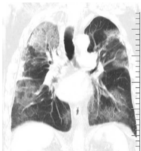
Figure 2: Computed tomographic slices showing patches of ground glass opacity.