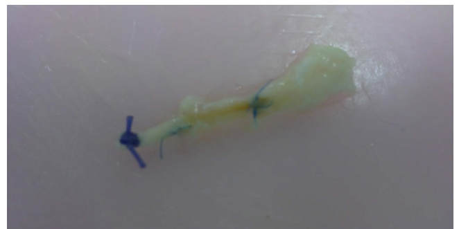
Figure 3: Anatomical piece extraction, including sciatic nerve stumps and graft.

paraformaldehyde solution (4% w/v, 4 g of solute are dissolved in 100 ml of solution) in 0.1 Molarity phosphate buffer (pH=7.4). Samples were obtained for macro and microscopic preparations. The explanted pieces of sciatic nerve with grafts were carved and cut into seven pieces, all different from each other in cross sections and size, but equally in all animals; pieces were processed in resin (toluidine blue staining) and also for paraffin embedding: hematoxylin-eosin and Masson trichrome.