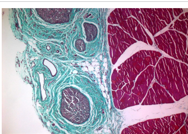
Figure 4: Development of nervous structure with regeneration signs and abundant perineural connective tissue to the left, resting on a block of muscle. Masson trichrome stain, magnified 5 times.

Quantitative evaluation of tissues and organs on histological sections has been the subject of heated scientific debate in recent years. Particularly, the emergence of a new approach to address the bias of the morphometric analysis, represented a significant advance in Neuromorphology [27-30].