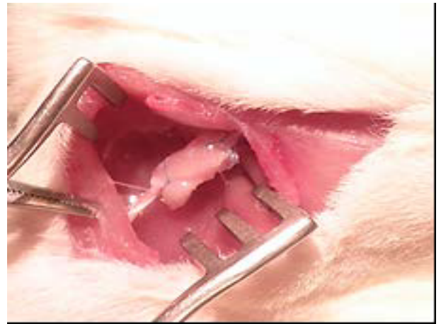
Figure 2: Denatured autologous muscle graft as a bridge of critical defect in the rat sciatic nerve (intraoperative image).