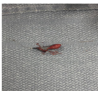
Figure 2: The retrieved "thrombus" attached to a foreign object from the common femoral artery, which was later identified as the Angio-Seal vascular closure device.

excellent efficacy and safety profile after routine catheterization and intervention [3,5]. However, clear indications for their use and the risk of complications need to be evaluated and monitored.