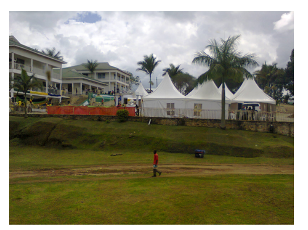
Figure 2: A blood donation camp organized by the Pharmacy Students Association.