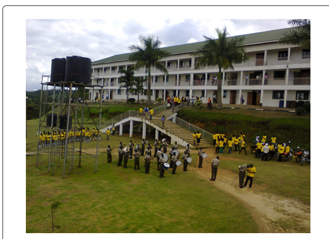
Figure 1: Pharmacy students association preparing for a road safety campaign.

There have been many positive changes that have occurred in the pharmacy students due to active participation in the association's activities. Many students have learnt teamwork skills, leadership