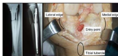
Figure 2: The anteroposterior and lateral radiographs of the specimen after osteotomy and the proximal tibial surface with the entry point of the tibial SIGN nail.