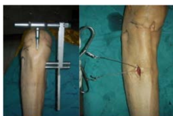
Figure 1: Tibial SIGN nail insertion and osteotomy point of the tibia.

For each radiographic and anatomical measurement, the sagittal and coronal step offs were calculated by using the regression analysis. They were considered to represent the relative contribution of the medial-lateral and anterior-posterior displacement to the optimal