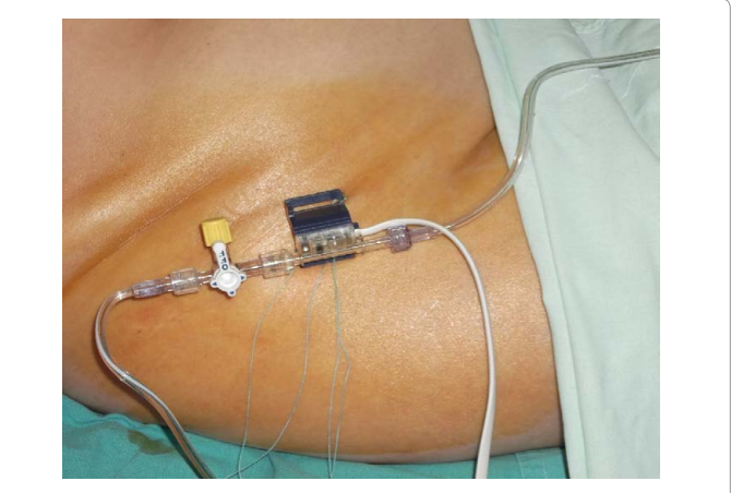
Figure 4: IAP pressure measurement with the transducer on the iliac crest.