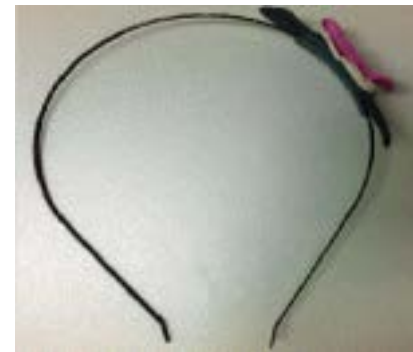
Figure 1: Head band.

Expectant management was maintained using topical corticosteroids (prednisolone) four times a day. Upon her return thirty days after the initial evaluation, she complained of floaters and flashes. BCVA had improved to 20/100, there was no corneal edema, remained adherent leukoma, and there was an improvement in vitreous haze.