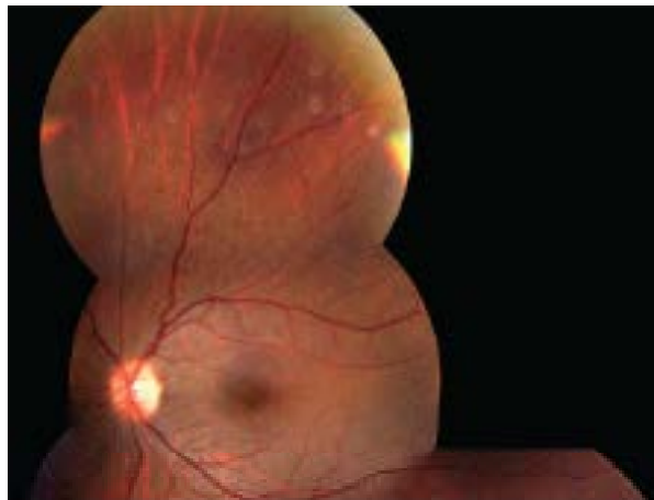
Figure 5: Final aspect of the patient: Two lesions in the inferior temporal at the extreme periphery surrounded by laser marks already pigmented.