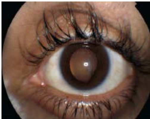
Figure 2: Left eye biomicroscopy showing adherent leucoma in the central area of the cornea.