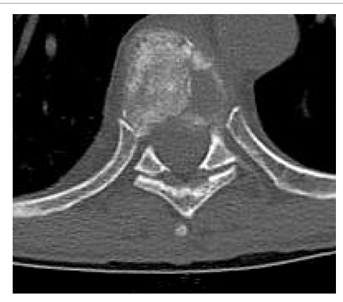
Figure 2: Axial CT scan showing moth eaten osteolysis.