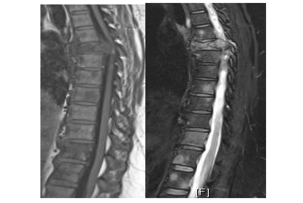
Figure 3: MRI thorax before and after administration of fat suppression (STIR) demonstrating improved visibility of metastasis.

In conclusion, workup of a patient with suspected spine or bone metastasis requires both local and systemic staging before considering