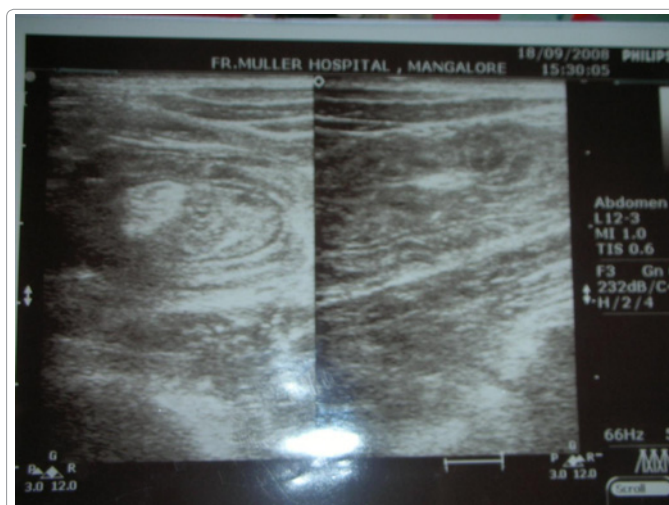
Figure 1: Abdominal ultrasound picture showing multiple concentric ring signs denoting Jejunojunal intussusception.

Abdominal tuberculosis accounts for 11%-16% of extra pulmonary TB [3]. Abdominal TB has diverse and non- specific symptomatology requiring a high index of clinical suspicion. Their usual presentation includes abdominal pain, weight loss, anemia, and fever with night sweats. Patients may present with symptoms of obstruction,