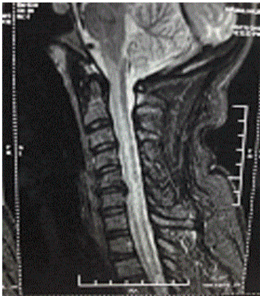
Figure 2: Showing hyper intense signals in cervical cord in MRI spine.