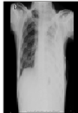
Figure 1: Chest x-ray (PA view) showing left sided pleural effusion.

Patient was conscious cooperative but ill looking. On examination patient was febrile, BP-110/70. His physical examination was suggestive of left pleural effusion. So the patient was investigated with chest X-ray which indicated significant flat air and left pleural effusion (Figure 1).