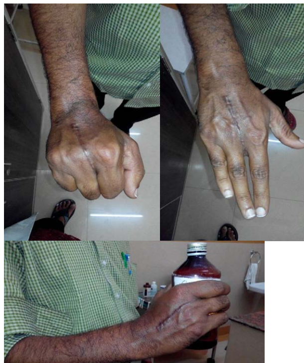
Figure 4: Post operative follow-up, demonstrating the grip strength.

[4]. The patients whom we present had monostotic pattern of the disease.