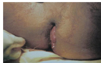
Figure 2: The extrusion of fat mass through anal canal without injuring the sphincter.