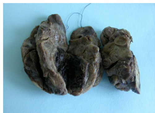
Figure 1: cut surface showing nodules of varying size, fibrosis and hemorrhage.

Dyshormonogenetic goiter (10 to 15% of permanent congenital hypothyroidism) is the name given to a family of inborn errors of metabolism that lead to defects in the synthesis of thyroid hormone [1].