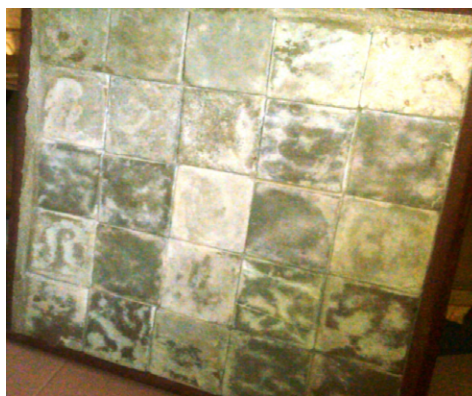
Figure 1: A Panel of the composite tiles produced from the recycled plastic materials.

Frictional coefficient test: The frictional coefficient test is used to obtain the slip properties of the tiles produced, this is done by placing the composite and conventional sample on a level platform, and a known mass of match box, toothpaste tube and a stone was placed on the composite. With one end of the material in position, the opposite end of the composite was continuously raised such that the material inclines at an angle. The angle of inclination was continuously increased until the mass placed on top of the composite rolled off. At this point the value of the angle of inclination was taken; this is called