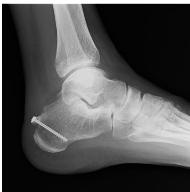
Figure 5: Plain radiograph after two months.

Calcaneal avulsion fractures are infrequent, and are diagnosed by radiography. Open reduction and internal fixation is recommended to achieve good fixation and to retain the function of triceps surae. In order to manage this fracture effectively, it is important to avoid skin necrosis and to ensure strong fixation that can resist the pull of triceps surae. There are some reports regarding the surgical management of this type of fracture. Tension band wiring allows good fixation, but sometimes cause skin and soft tissue problems due to the edge of the wire [5].