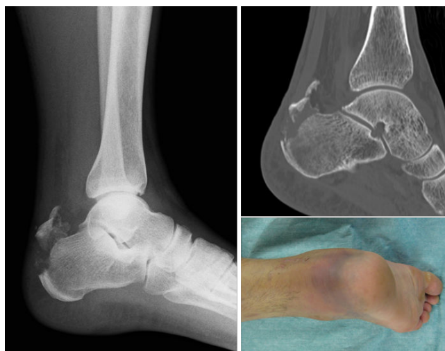
Figure 1: A plain radiograph (left hand panel) and computed tomography image (upper right) demonstrating a type I calcaneal avulsion fracture. The skin condition was acceptable at the time of surgery (lower right), 3 days after the trauma.