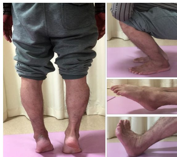
Figure 4: The patient could stand on his toes (left hand panel) and crouch (upper right). His ankle range of motion was excellent, in both plantar flexion (middle right) and dorsiflexion (lower right).

Postoperatively, the patient used a brace to maintain the ankle in the natural position (20° plantar flexion) for three weeks. Full weight bearing with Achilles boots and range of movement exercise were started after the brace was removed. The follow-up period was 12 months. At 3 months, his ankle range of motion was 60° plantar flexion and 30° dorsiflexion (Figure 4), and he could perform all movements without any difficulty of support. His preoperative American orthopaedic foot and ankle society score was 52/100, and after 3