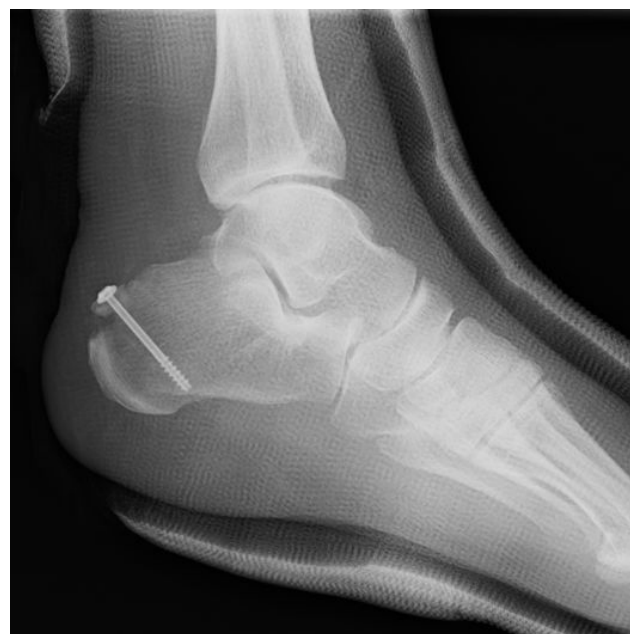
Figure 3: Post-operative plain radiograph.

the distal anchor, resulting in the final knotless repair (Figure 3). We sutured the paratenon and skin without any tension.