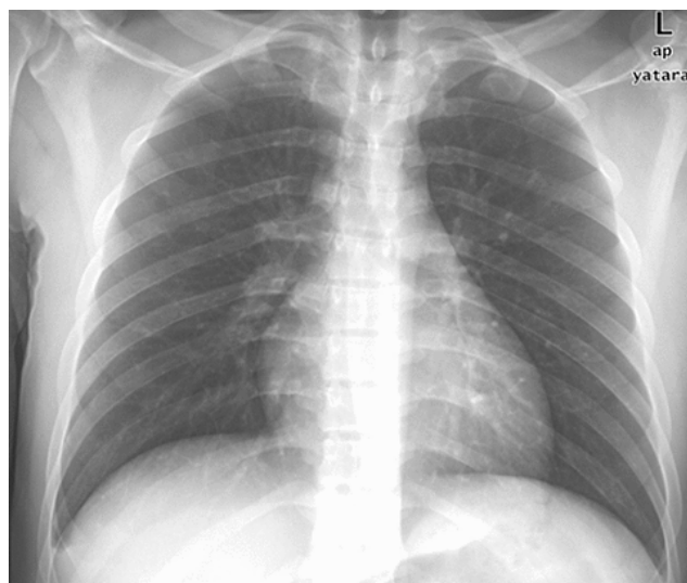
Figure 1 b: Control chest radiograph after treatment

Ophthalmologists were consulted to look for retinal globules. As they found out characteristic fat globules on retinal examination (Figures 2a and b), the patient was diagnosed as fat embolism. Intravenous glucocorticoid, oxygen and supportive treatment were administered after diagnosis. Clinical improvement was observed during follow-up. Pulmonary symptoms resolved in a few hours; also radiological findings regressed in a short time (Figure 1b). ABG analysis revealed no more hypoxemia. The general health status of the patient made a good progress; and he was discharged from hospital with the plan of reducing glucocorticoid dosage in stages.