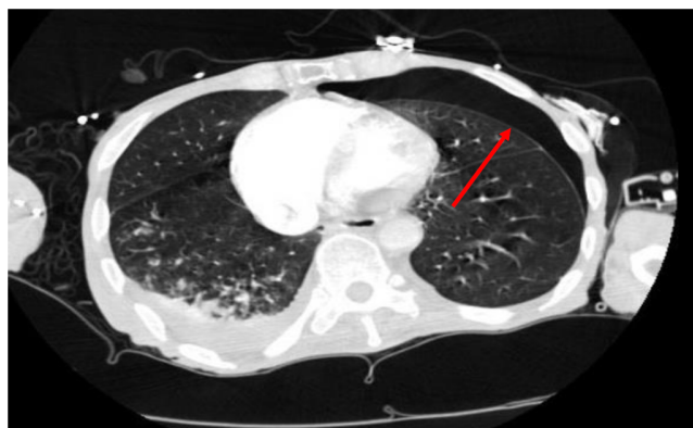
Figure 1: Emergency department chest computerized tomography. Notice the bilateral severe chronic lung disease and left pneumothorax (red arrow).