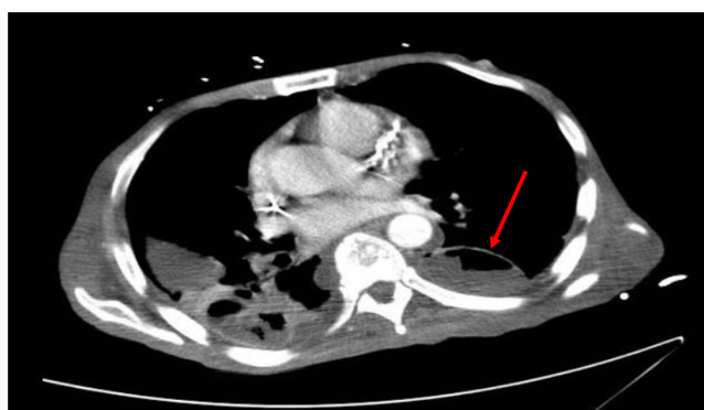
Figure 3: Chest computerized tomography day eleven of hospitalization demonstrating left parapneumonic empyema (red arrow).