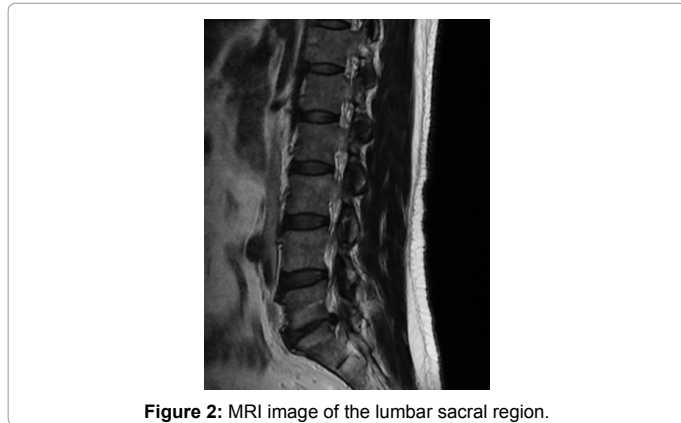
Figure 2: MRI image of the lumbar sacral region.

In March 2017, the man commented that the functional performance of his right leg was almost normal and he resumed jogging, so we decided to stop the treatment in May. At five months' follow-up (October 2017), we consulted the neurologist and conducted NCS and EMG testing to determine the improvement in nerve injury (Tables 1 and 2). During the EA intervention, we recorded AROM values from January through May 2017 (Figure 3). The angle of dorsiflexion between the tibia bone and the first metatarsophalangeal joint in the supine position (MA1; measurement angle 1) improved from 120° to 100°, and the angle of dorsiflexion between the fifth metatarsophalangeal joint and horizontal line in the seated position (MA2; measurement angle 2) also improved from 15° to 30°. In December 2017, even though EA had been discontinued for more than 6 months, there were clear improvements in motor nerve velocity and F-wave testing. In addition, EMG results of the DFN were at near-normal levels (Tables 1 and 2), AROM values were maintained (Figure 3) and the man was running as he had before the injury, twice a week for 7 km each time, without any discomfort.