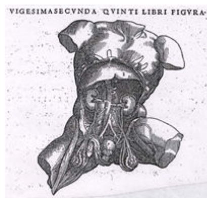
Figure 3: The 22th figure of the 5th book of Vesalius’ De humani corporis fabrica : the right kidney is clearly and erroneously higher than the left!

He still maintained (like Aristotle and Galen and all the subsequent authors) that the right kidney was higher than the left (Figure 3).