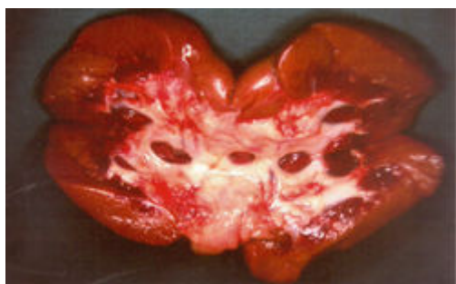
Figure 2: The dissected kidney of a pig illustrates Berengarius’ description of the “papillae”.

former and true correctness) (Bologna, 1521). He injected hot water into the kidney through the “vena emulgens” (the renal vein) and observed that the liquid didn’t flow directly into the pelvis, but accumulated into the substance of the kidney. Then he incised the surface of the kidney and observed that the accumulated liquid spurted from the incision. At this point he injected hot water into another kidney (most likely a pig’s kidney), dissected it not from the convex, as had always been done, but from the concave side, and discovered the “papillae like female nipples” through which the injected water percolated into the pelvis like milk does through the female nipples (Figure 2).