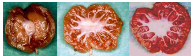
Figure 5: The monopapillary kidney of a kid we have dissected and abraded as Vesalius did of the monopapillary kidney of a dog. His great mistake is clear mainly in the 3rd particular.

Nevertheless, there is no doubt that his work gave an impulse to the renewal of the studies of anatomy in general and of the anatomy of the kidney in particular, and that his book (like Copernicus' (1473 – 1543) De revolutionibus orbium coelestium published in the same year in Nuremberg) was much more determining than the work and the discoveries of Berengarius, although they were really exceptional and absolutely more correct than Vesalius' ones.