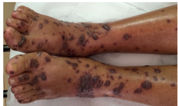
Figure 1: Skin lesions—Multiple rounded and confluent palpable purpura and tense blisters on lower limbs.

A computerized tomography (CT) scan was performed, showing bilateral alveolar infiltrates and a small indeterminate solid nodule on left lower lobe. Daily oral prednisone was started (up to 1 mg/kg) with no improvement. The patient evolved with respiratory insufficiency, with severe hypoxemia, and then intravenous (IV) methylprednisolone 1 g/day was prescribed for three days.