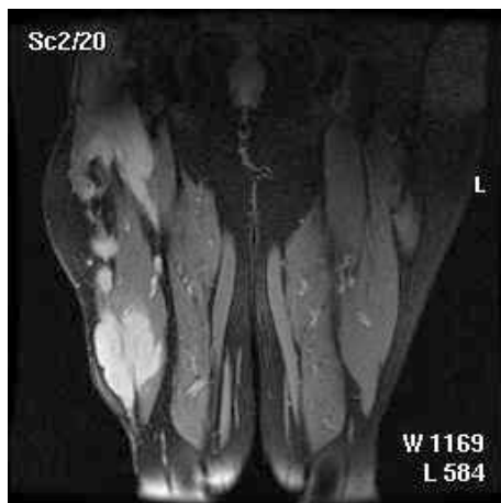
Figure 3: MRI aspect.

The postoperative evolution was uneventful and the patient was discharged after 8 days. The pathology report revealed a desmoid tumor. As recommended by the oncology board, adjuvant radiotherapy was performed. One year later the patient was readmitted for a 6×3 cm tumor mass, located on the posterior face of the lower third of the same thigh, clinically and radiologically suggestive for a local recurrence. Wide tumor excision was carried out and histological result was again desmoid tumor. The patient underwent for chemotherapy with methotrexate and vinblastine and antihormonal therapy with tamoxifen. After 20 months the patient was hospitalized for a new recurrence showing symptoms and signs of sciatic nerve paresis. The MRI showed an inhomogeneous 5.7×15.6 centimeters large tumor mass that invades almost entirely the right biceps femoris muscle extending to the vastus lateralis muscle. Superior to this one, the images showed another tumor mass located on the posterior face of vastus lateralis and major gluteal muscle, 5.3×10×3.5 centimeters large and with imprecise boundaries (Figure 3).