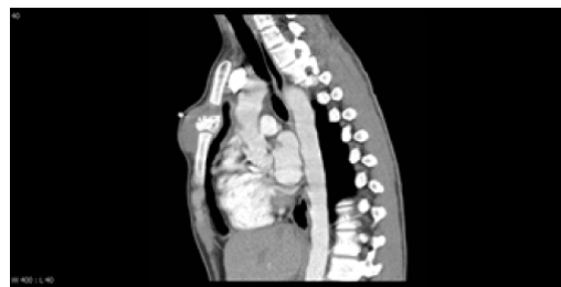
Figure 1: CT scan of the chest showing the sarcoma of the sternum.

chemotherapy (vincristine, cyclophosphamide, and topotecan). The tumor decreased in size by two-thirds its original size. Five months later the tumor was excised in a circumferential fashion with 1.5 cm negative margins (Figure 2). One third of the sternum was removed along with adjacent intercostal muscles and rib ends. The plastic surgery team placed alloderm over the heart, polypropylene mesh, mobilized a left latissimus dorsi muscle flap and tunneled it under the left chest over the sternal space. Three sternal plates were placed across the sternum. Post-operatively, the patient did well and was discharged to home on post-operative day 10. The patient has been seen in the clinic and is doing well post-operatively (Figure 3). He is now one year after diagnosis and he is in good health with no evidence of recurrent tumor.