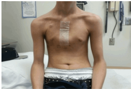
Figure 3: Postoperative wound.

The first case was reported in a 12 years old female who was successfully treated with chemotherapy and radiation followed by surgery [3]. The second case was found in a series of 107 cases from Tara Memorial Hospital in Bombay, India [4]. The third case was reported in a large study of 11,087 bone tumors in the Dahlin tumor series at the Mayo Clinic. In their study, only 66 (0.6%) were primary malignant tumors of the sternum. Among those, only 66 were primary sternal malignancies including 22 chondrosarcomas (33%), 20 myelomas (including plasmacytomas) (30%), 14 lymphomas (21%), eight osteosarcomas (12%), one fibrosarcoma (1.5%), and one Ewing sarcoma (1.5%) [5]. The last case was reported in the most recent report from Memorial Sloan Kettering Cancer Center describing their experience with primary and secondary malignancies of the sternum over 69-year period (1930 to 1999). In their series of 58 patients with primary sternal malignancies were identified. Among this, there were 28 chondrosarcomas (48%), 11 osteosarcomas (19%), nine plasmacytomas (15.5%), six lymphomas (10%), one fibrosarcoma (1.7%), one angiosarcoma (1.7%), one malignant fibrous histiocytoma (1.7%), and one Ewing sarcoma (1.7%), [6].