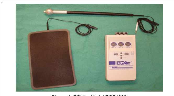
Figure 1: EGXtra Model EGS4000.

A total of 22 patients were treated. The majority were males (72%). The mean age was 56 years old (range 30-86). The mean duration of symptoms was 60 months (range 3-240). 41 percent of patients had additional anorectal pathology (anal fissure, anal fistula and hemorrhoids). Over 60% of patients were taking muscle relaxants and/ or analgesics. Fifty-nine percent of patients had previous treatments, including biofeedback (32%), botox injection (14%) and epidural injection (14%). The mean number of EGS sessions was 7.5 (range 2-15). The average duration of each session was 29 minutes for the initial visit and 46 minutes for the concluding visit. The intensity was 70% at initial visit, and 88% by the last treatment (330 volts=100%). Patients' assessment of results at the last session is shown in Figure 2. Complete relief or significant improvement in 8 (36%); moderate improvement in 2 (9%); slight improvement in 7 (32%); and no improvement or worsening of pain in 5 (23%). The mean follow up was 11 months (range 0.4-38). There were no complications associated with the EGS. Table 1 summarizes our patient population based on gender, time with the diagnosis (months), previous treatments before undergoing EGS, number of EGS sessions and the outcomes after the last session. In the "Results" column we assessed the outcomes according to the Visual Analog Scale for pain reported by the patients in the chart during the