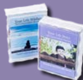
Your Life Talks Conversation Starter Cards