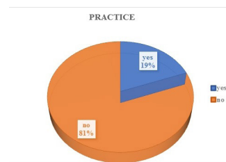
Figure 4.2 Respondents' performance of BSE (n=384)